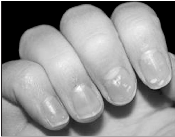
Patient with Leukodynia before HPU treatment