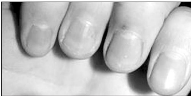
Same patient after 3 months on HPU treatment